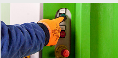
IP56 control panel for easy operation