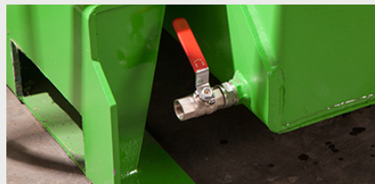
40-litre liquid retention tank with outlet tap