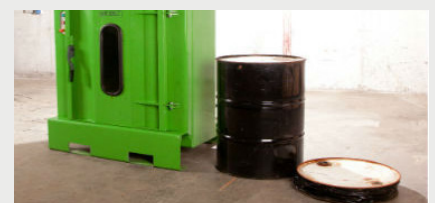
Crush drums to a fraction of their size