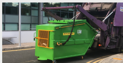
Materials emptying from closed bin into REL truck