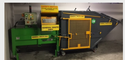
Bin Size can be adapted to site requirement